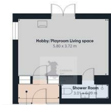
Floor 0 Building 3